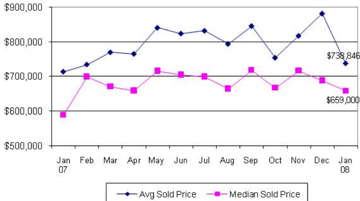
Average and Median Sold Price Arlington County Single-Family Detached