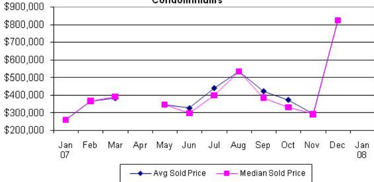
Average and Median Sold Price City of Falls Church Condominiums