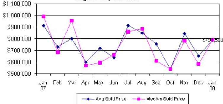
Average and Median Sold Price City of Falls Church Single-Family Detached