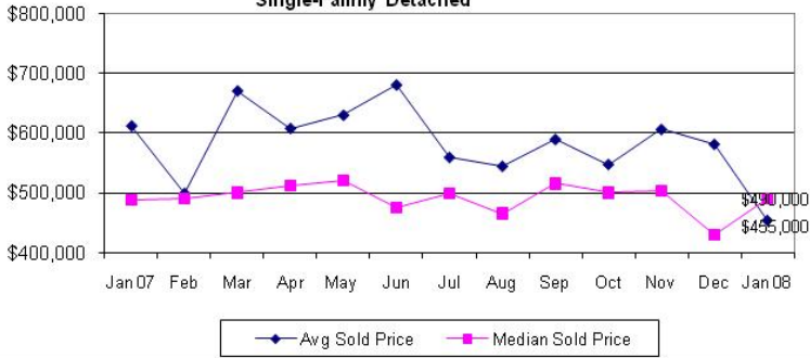
Average and Median Sold Price City of Fairfax Single-Family Detached