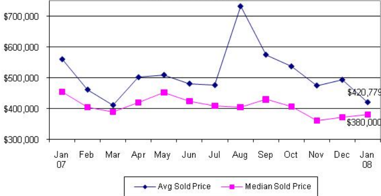
Average and Median Sold Price Fauquier County Single-Family Detached