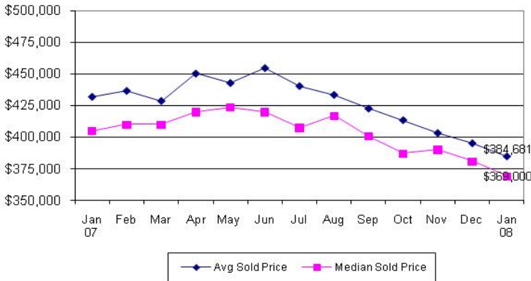
Average and Median Sold Price Fairfax County Single-Family Attached